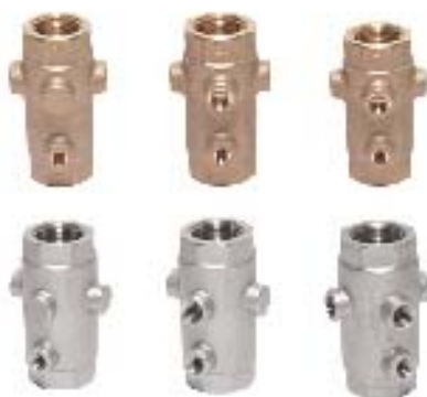
VFD Tapped Valves

Patented submersible pump check valve for use on variable flow demand (VFD) systems and applications. Standard check valves will "chatter" and be noisy when the system goes to low flow, eventually causing failure. These unique valves are designed to minimize flow losses