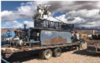
Triflo MFS2500 Mud Pit $52K

See Our Entire Inventory At: BeemanEquipmentSales.com