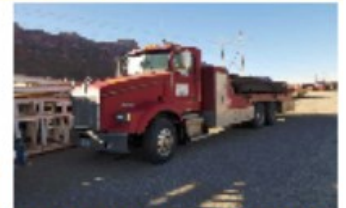
1994 KW T800 H2O Truck $33K

See Our Entire Inventory At: BeemanEquipmentSales.com