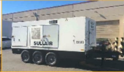
Sullair 1150/350, 900/500; CAT C-15 $97K