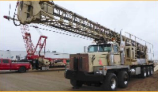
2004 I/R T3W; Tophead Drive...$345K

435-259-7281 · info@BeemanEquipmentSales.com