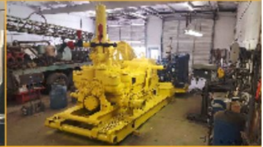
GD 7 1/2 x 14 Duplex, P/B Detroit...$38K