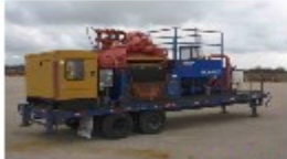
American Augers Mud Pit $58K

See Our Entire Inventory At: BeemanEquipmentSales.com