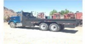
Intern. 9300 Water Truck $21K

See Our Entire Inventory At: BeemanEquipmentSales.com