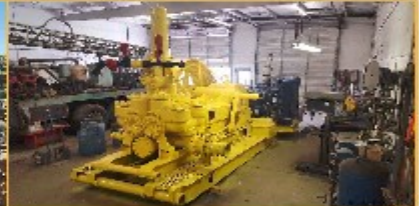
GD 7 1/2 x 14 Duplex, P/B Detroit...$38K