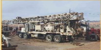
2001 GEFCO 40K: Tophead Drive...$285K

435-259-7281 · info@BeemanEquipmentSales.com