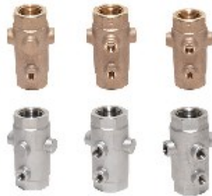
VFD Tapped Valves

Patented submersible pump check valve for use on variable flow demand (VFD) systems and applications. Standard check valves will "chatter" and be noisy when the system goes to low flow, causing eventual failure. The unique valves are designed to minimize flow losses and hydraulic