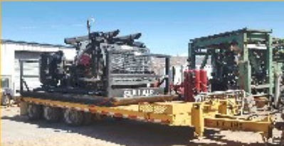
Sullair 1350/350, 1150/500; CAT C-18 $83K